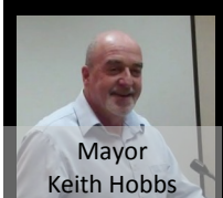
Mayor Keith Hobbs

SJFY is an initiative of the Ontario Youth Opportunities Strategy