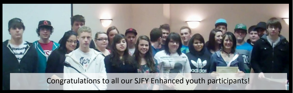
Congratulations to all our SJFY Enhanced youth participants!

SJFY is an initiative of the Ontario Youth Opportunities Strategy