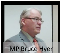
MP Bruce Hyer

YES is also funded by its own fundraising initiatives. Partnership programming working for you