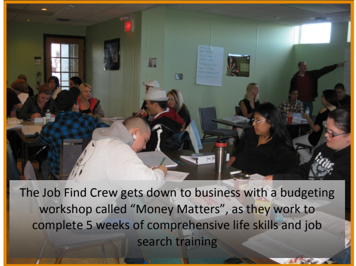
The Job Find Crew gets down to business with a budgeting workshop called "Money Matters", as they work to complete 5 weeks of comprehensive life skills and job search training

The Youth Skills Link program provides extensive employment preparation to selected participants, as well as a paid placement in their chosen field of interest. 5 weeks of comprehensive in-class training provides youth with the opportunity to challenge personal barriers and learn effective job search and job maintenance practices. The placements provide work experience leading to sustainable employment and enhanced career opportunities.